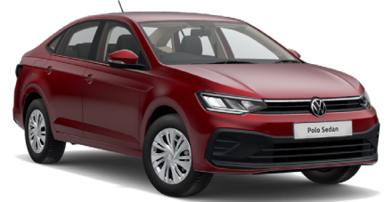
Wild Cherry Red Metallic