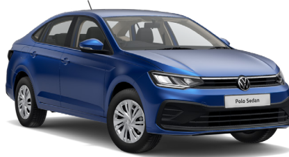
Rising Blue Metallic