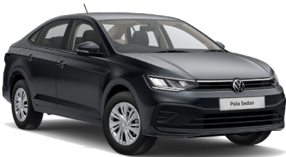
Carbon Steel Gray Metallic