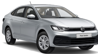
Reflex Silver Metallic