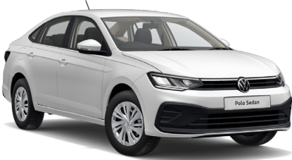
Candy White Solid

The illustrations on this page can only be regarded as a general guide as digital rendering cannot capture the true depth and brilliance of the paint finishes with absolute accuracy. Please note that certain paint and trim combinations may not be available.