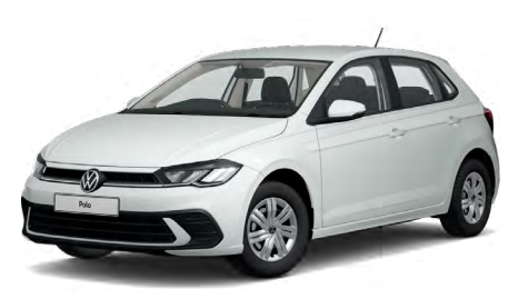
Pure White Solid Colour