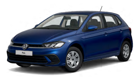
Reef Blue Metallic