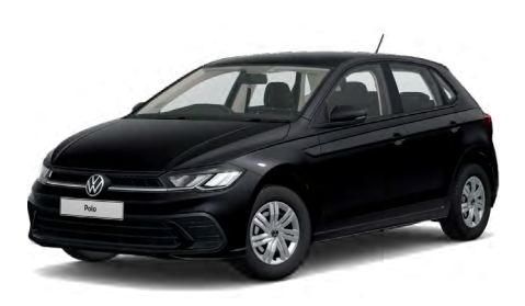
Deep Black Pearl Pearlescent