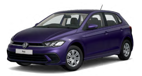
Vibrant Violet Metallic

The illustrations on this page can only be regarded as a general guide as digital rendering cannot capture the true depth and brilliance of the paint finishes with absolute accuracy. Please note that certain paint and trim combinations may not be available.