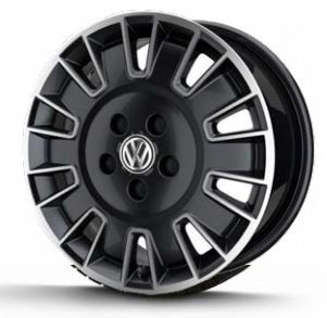
"Posada Black Diamond" alloy wheel 17" (Optional)