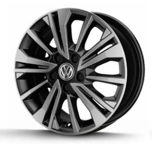
"Aracaju Black Diamond" alloy wheel 17" (Optional)