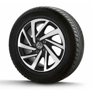
"Woodstock Black Diamond" alloy wheel 17" (Standard)