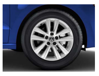
Estrada 15" alloy wheels (Standard on Comfortline / Optional on Trendline)