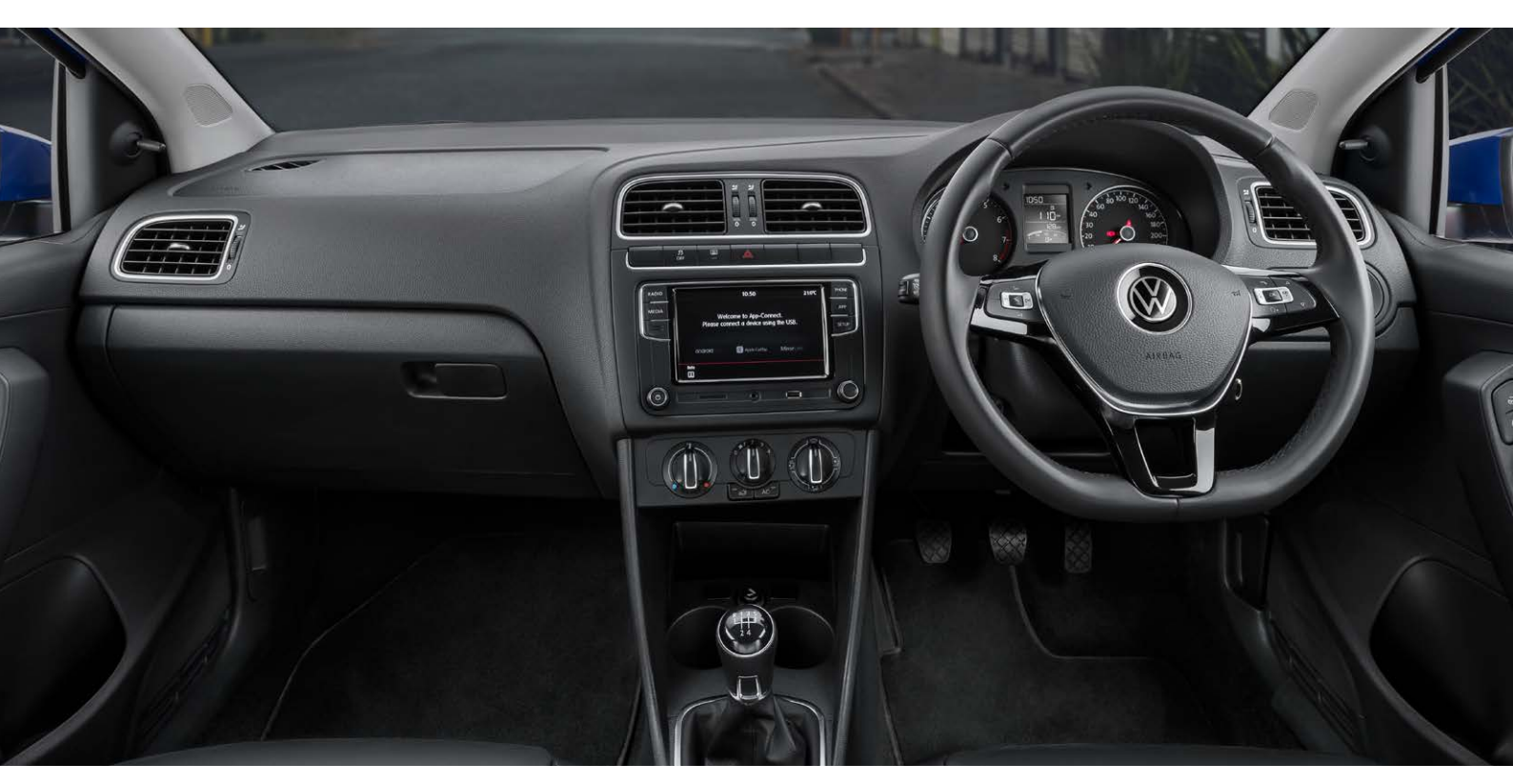
Note that this is a Highline with optional features

As the adage goes, it's what's on the inside that counts the same is true for Polo Vivo. It raises the bar for vehicles in its category.