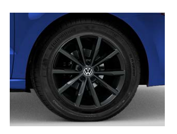
Portago 16" gloss black alloy wheels (Optional on Comfortline and Highline with Black Style Package)