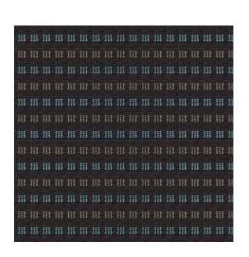
City Cloth seat trim (Standard on Comfortline)