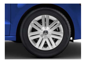
14" steel wheels (Standard on Trendline)