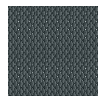
Cable Cloth seat trim (Standard on Highline)