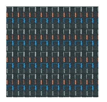
Tradition Cloth seat trim (Standard on Trendline)