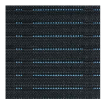
Space Cloth seat trim (Standard on GT)