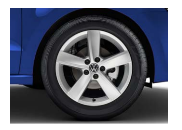
Rivazza 16" alloy wheels (Standard on Highline / Optional on Comfortline)