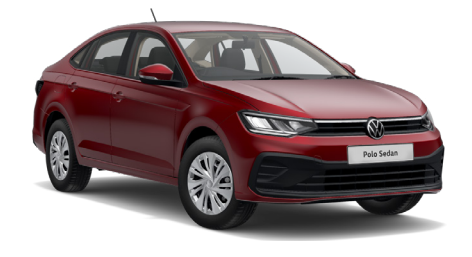
Wild Cherry Red Metallic