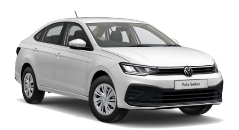
Candy White Solid

The illustrations on this page can only be regarded as a general guide as digital rendering cannot capture the true depth and brilliance of the paint finishes with absolute accuracy. Please note that certain paint and trim combinations may not be available.