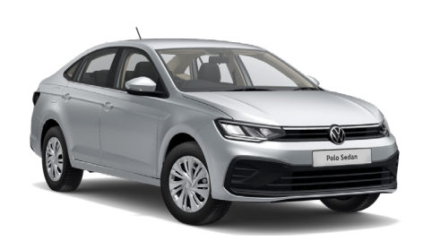
Reflex Silver Metallic