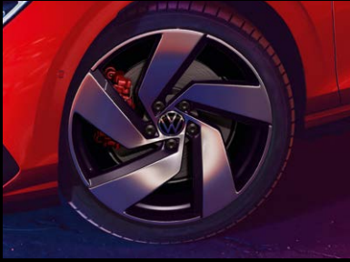
Richmond 7.5J x 18 alloy wheels (Standard)