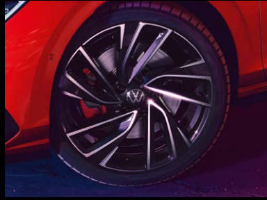
Adelaide 8J x 19 alloy wheels (Optional)