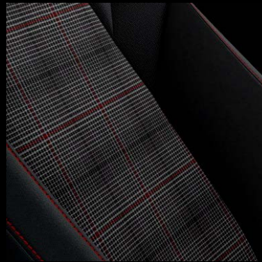
"Jacara fabric" (Standard on Jacara Edition)